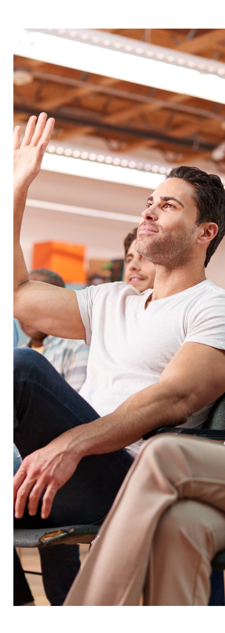
Table 2 summarises how the Borough's housing associations consult with residents at the most formal level.

Resident representation on the Board allows a clear, direct route into the highest level of governance. Nonetheless, formal representation on the Board can have its limitations, particularly for larger, national organisations. For example, it is difficult for the broad views of residents to be encompassed by one or two board members when housing associations operate across regions. They must therefore, consider how to ensure their structures are representative of the individual areas they cover. Whilst designated resident Board positions might work for smaller organisations, those that cover larger geographical areas might benefit from involving residents on separate committees with links into the Board. These can allow more residents to be involved at the highest level and therefore reflect the wider views of residents. It is, however, important to ensure that committees have robust and meaningful routes to feed into the Board, for example opportunities to provide regular feedback and attend Board meetings.