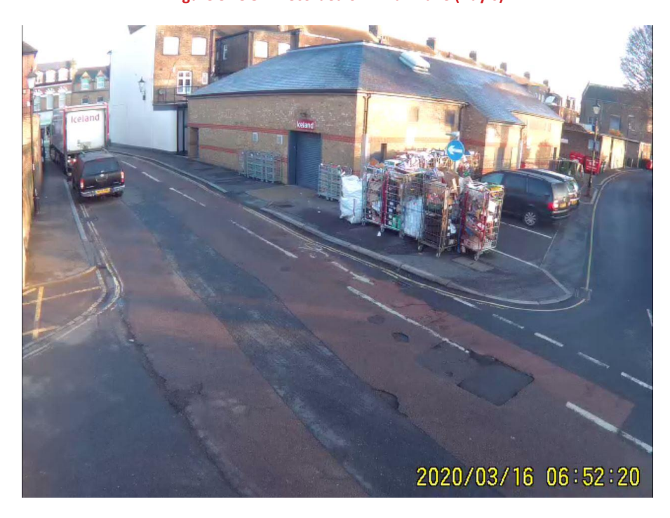
Figure 9. OGV2 recorded on Servicing Road (Day 6)