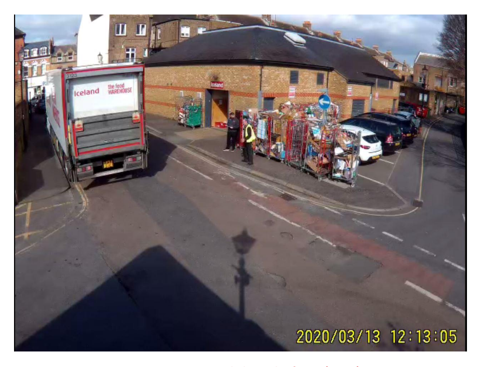
Figure 7. OGV2 recorded on Wharf Lane (Day 5)