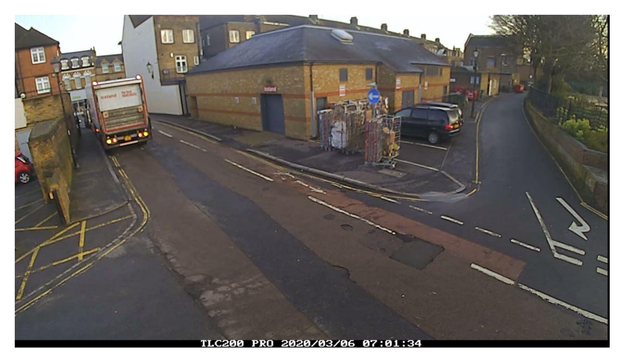
Figure 3. OGV2 recorded on Wharf Lane (Day 2)