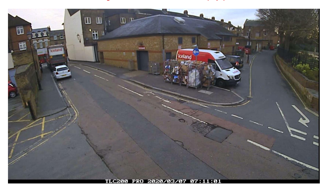
Figure 5. OGV2 recorded on Wharf Lane (Day 3)