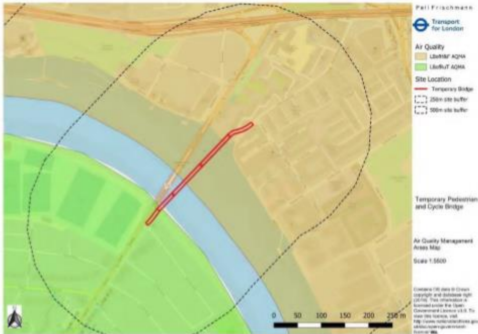
Figure 10 – Air Quality Management Areas

The northern extent of the proposed Temporary Bridge falls within the Hammersmith and Fulham Air Quality Management Area (AQMA) and the southern end falls within the LBRuT AQMA. These AQMA were declared by London boroughs due to exceedances of NO 2 and PM 10 . The key sources of such pollutants are attributable to road traffic associated emissions. These are shown in Figure 10.