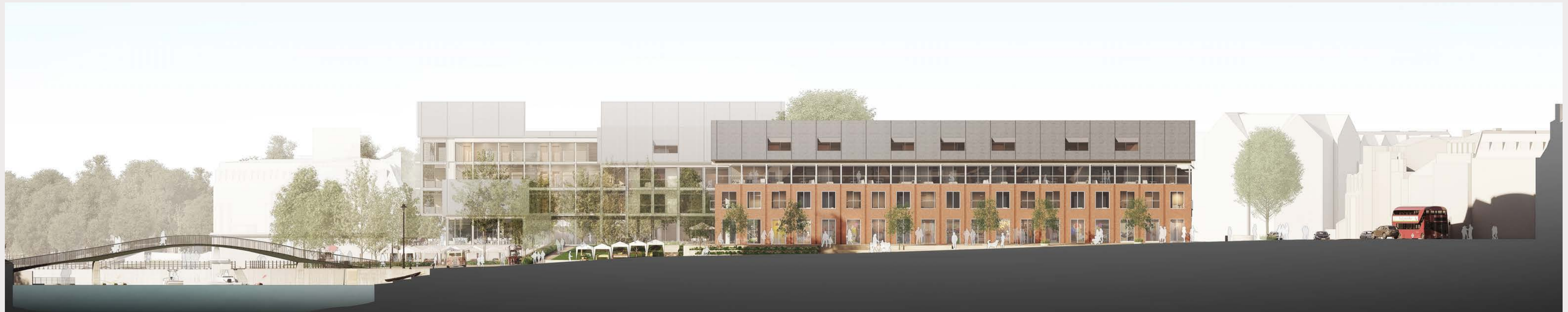
Water Lane elevation