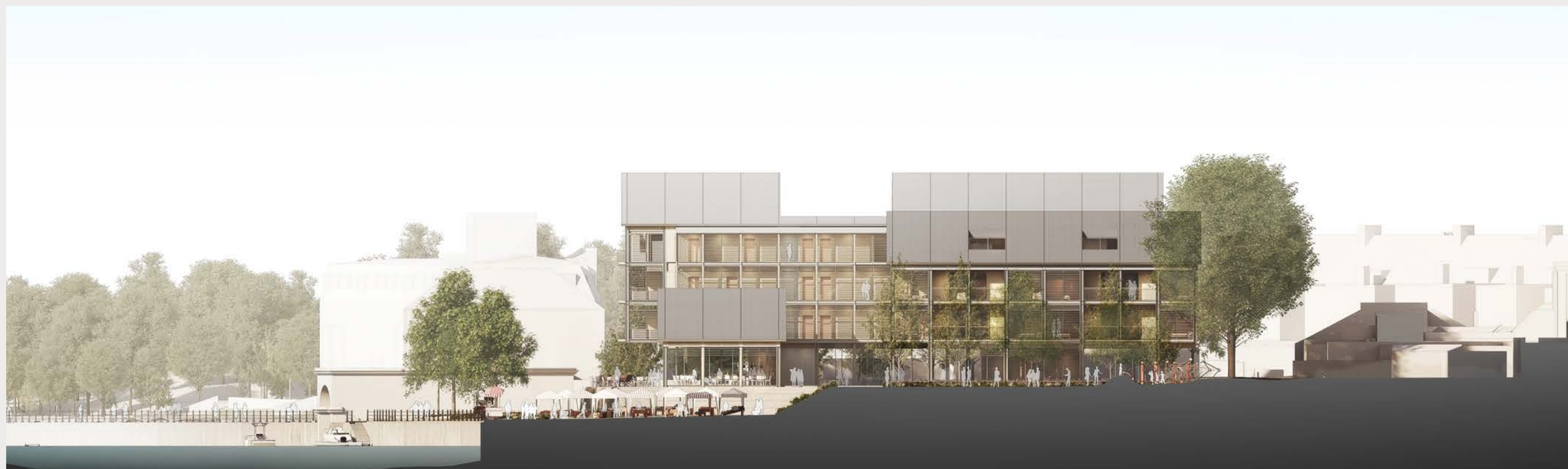
Wharf Lane building elevation from the Gardens

Materials currently being investigated - red brick on Water Lane and metal and terracotta on Wharf Lane with standing seam roofs on both.