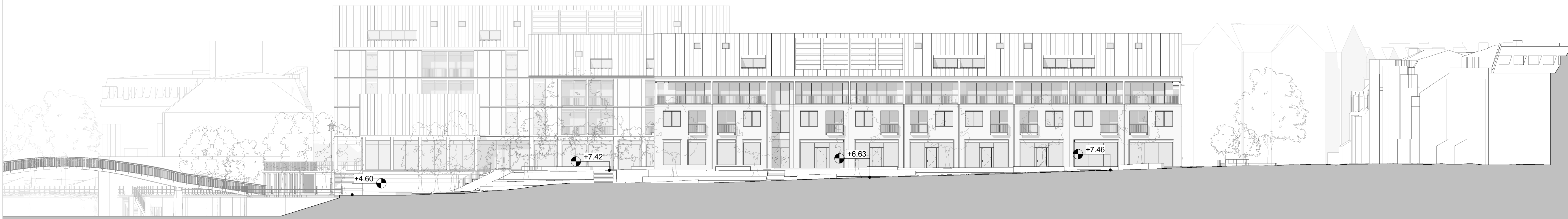
1 Proposed Site Section - Water Lane 2601 1:250