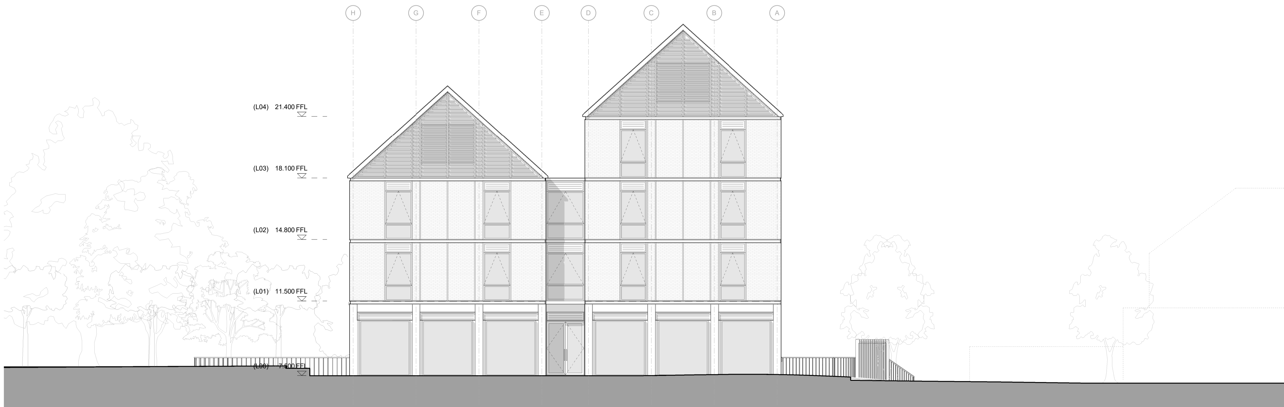
2 Wharf Lane - Service Road Elevation 2650 1:100