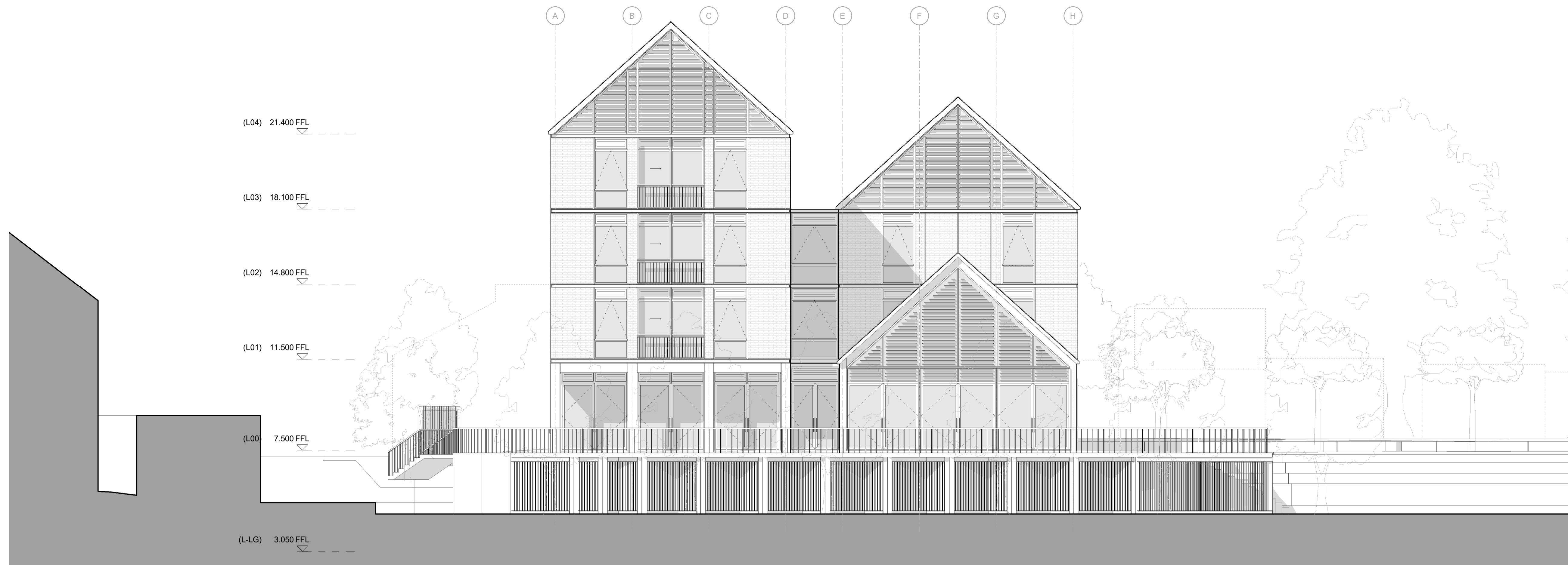
1 Wharf Lane - Embankment Elevation 2650 1:100