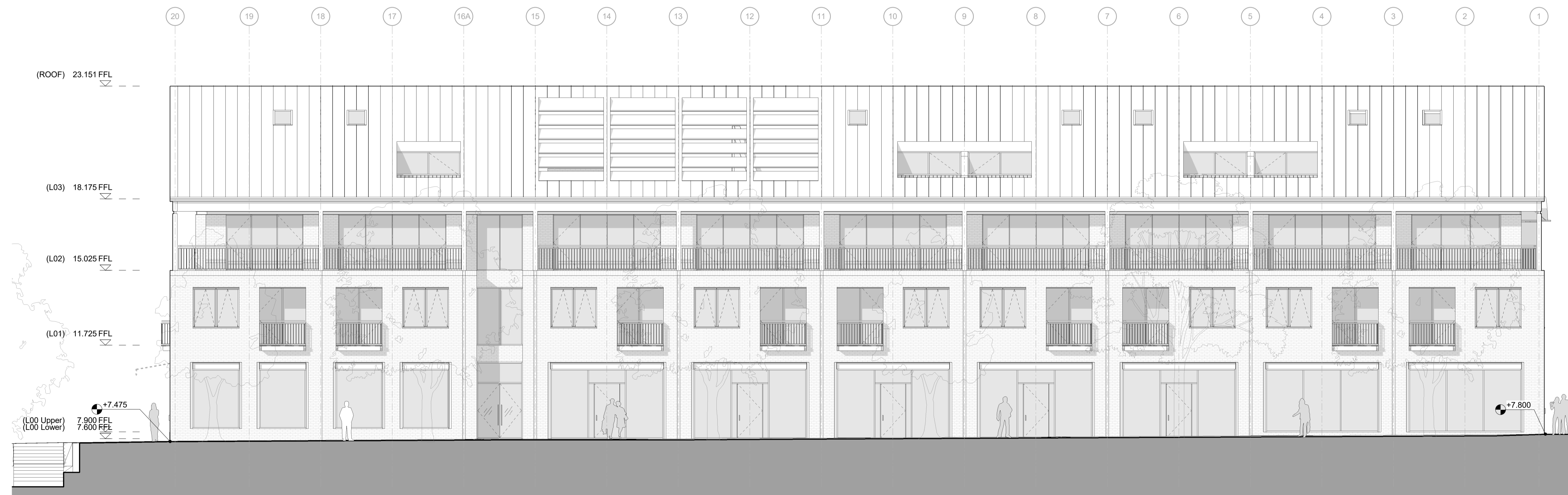
3 Water Lane - Water Lane Elevation 2661 1:100