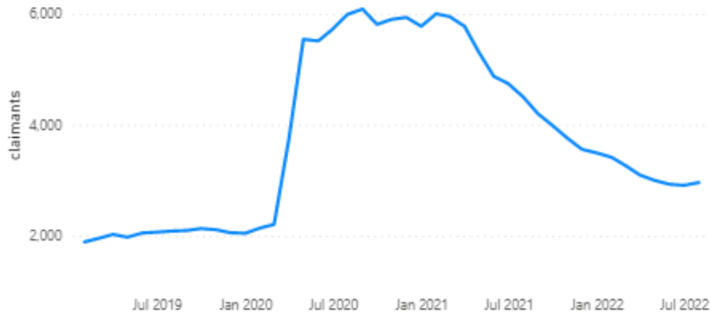
Households on Universal Credit