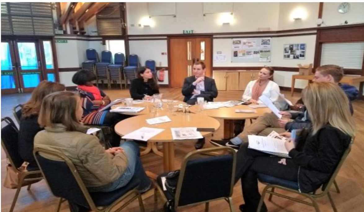
'Get to know your community' event at Age UK

10.2 The progress made in 2019/20 has helped to shape the way forward for the coming year. It is anticipated that 2020/21 will enable positive progress in the way that we promote a learning culture that aims to support high quality relationship-based practice in adult social care to enable excellent outcomes for our local communities.