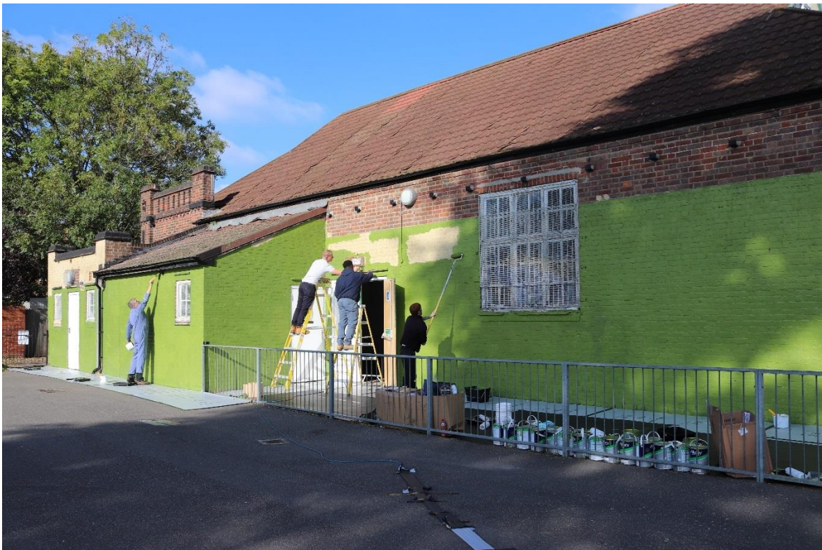
The hall being painted as part of a community day in partnership with the Metropolitan Police (25 th October 2018).

The toilets are not currently available to other park users but opening them at peak times is an aim of the Friends of Murray Park.