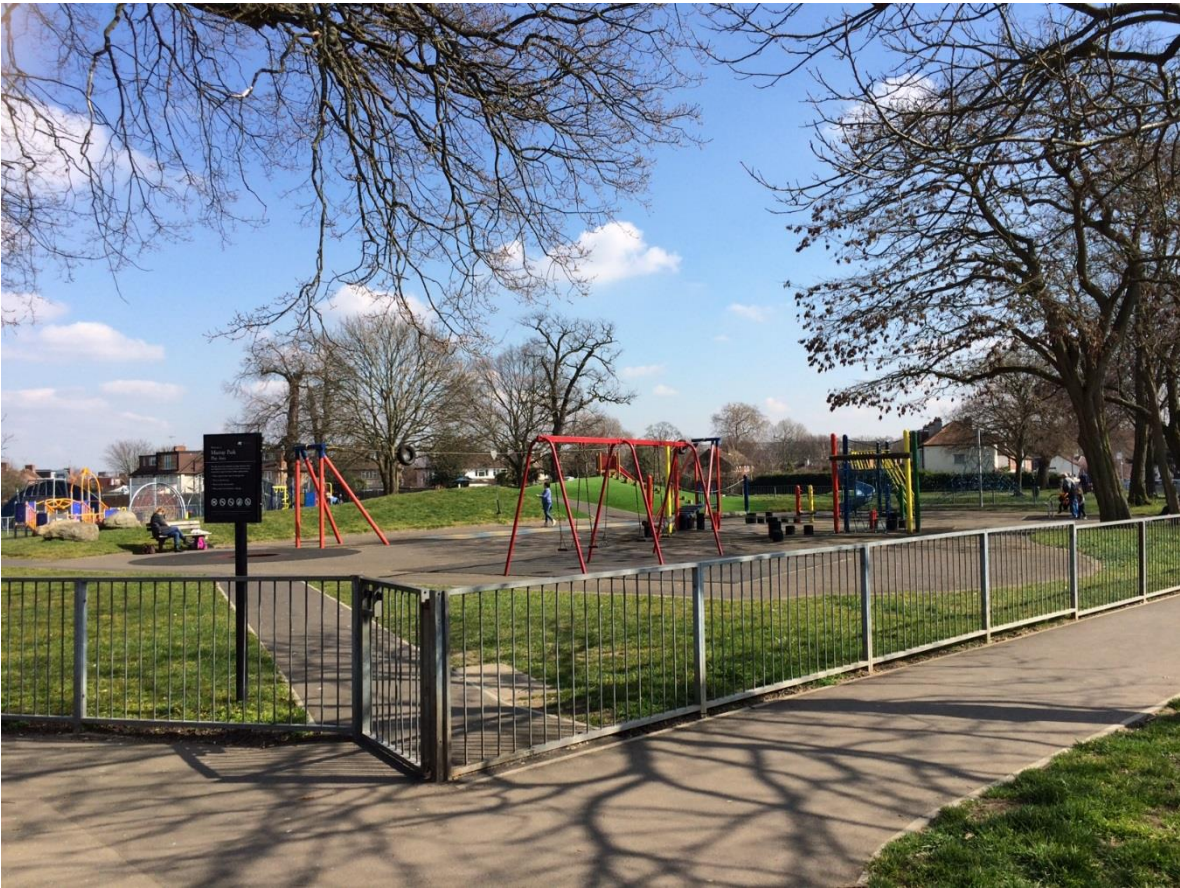
Play area, Murray Park

The playground is in good condition and have appropriate signage and has a wide range of challenges for children of all ages. The play area was upgraded in 2014, with new equipment installed.