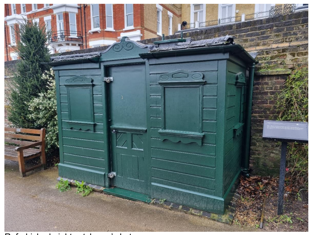
Refurbished nightwatchman's hut