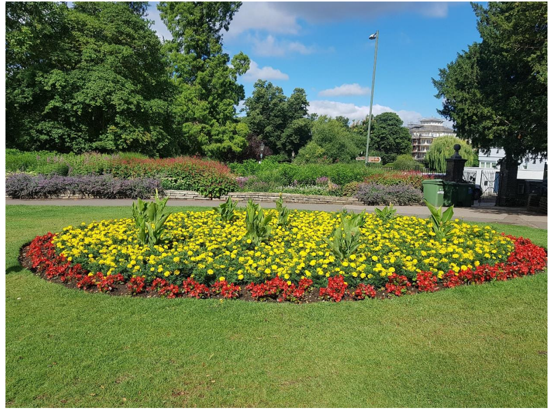
Formal bed near the Petersham Road entrance