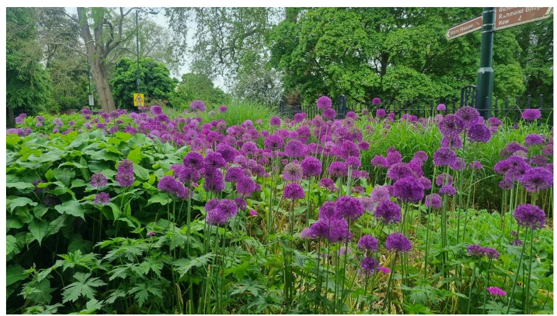
Alliums near the Petersham Road entrance

of available budgets seems likely for the foreseeable future. The borough will continue to work closely with its partners, in this case Continental Landscapes, to maintain standards. In addition, we will need to look for additional ways of funding to maintain and improve the boroughs parks, one of our most valuable assets.