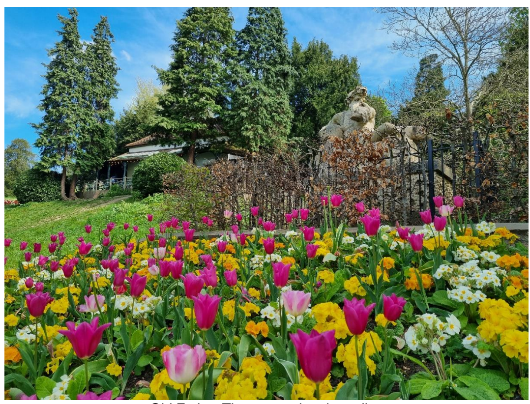
Old Father Thames and spring tulips