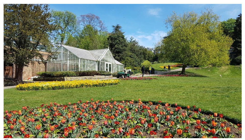
Entrance to the park from Petersham Road

The main entrance into both Terrace and Buccleuch Gardens is from the Petersham Road. The entrance areas are in very good condition with the tarmac pathway throughout both Gardens having been recently resurfaced. The wall around the attractively planted border to the right of the entrance way into Terrace Gardens has been completely renovated. Attractive corporate signage is appropriately positioned.