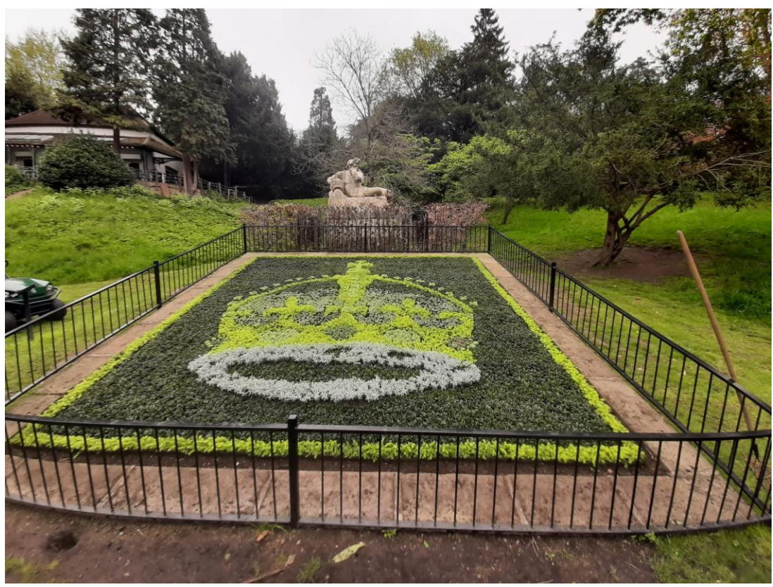
New fencing around Coronation Celebration carpet bed.