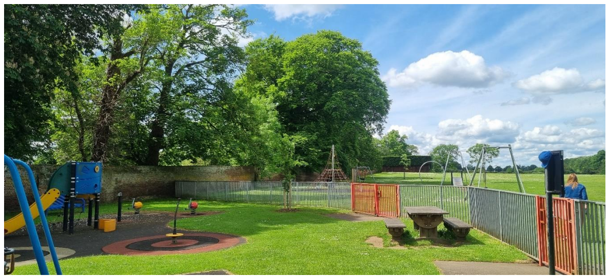
Toddlers play area – equipment for older children is in the main area of the park

There is a play area for older children based on a fitness trail concept with a zip wire.