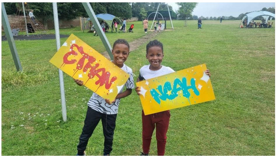
Youth Event September 2023

In 2023 the Parks Team held their first independent Youth Event this was held at the site and was held while the Parks Team were consulting the young people of Richmond to see what they want and need from their local parks. They were able to participate in drumming, have free bike servicing, street art and learn about local nature.