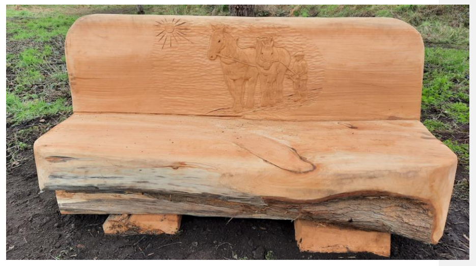
Mill Road Meadow Bench to commemorate the use of horses for meadow management within Crane Park