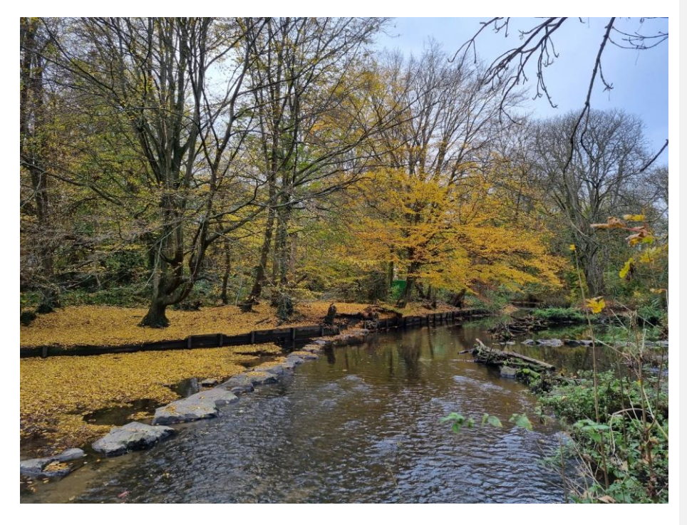
Autumn river view