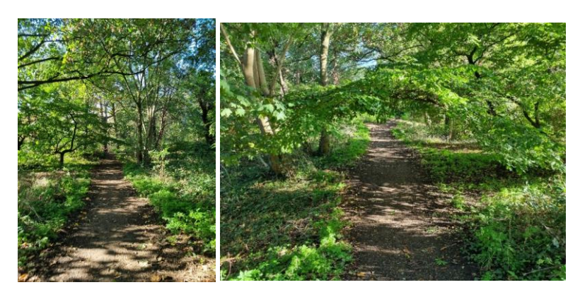
Woodland pathways within Crane Park

This Management Plan is not 'set in stone'. It provides a framework and guidelines that enable the London Borough of Richmond upon Thames to manage the site to a high standard in a sustainable way. The Council is open to the changing needs of local communities and will continue to work closely with The Friends of the River Crane Environment (FORCE). The Plan will run from January 2024 to December 2025, with an interim progress update in January 2025.