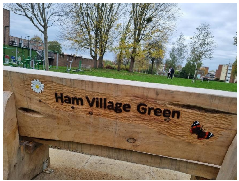
New carved site bench that is new to the new meadow area