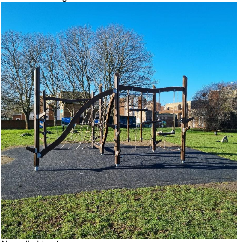
New climbing frame

The play area is in good working condition and offers a variety of play experiences from natural play to basket swings. There is also an area with exercise equipment installed. This is popular with both children and adults alike. The children's play area has been reconfigured to ensure continuity of play provision whilst the large compound is being hosted at site – from 2024-2026 when the build is in progress. A new basket swing, play panels and a large wooden climbing frame was installed in late 2023.