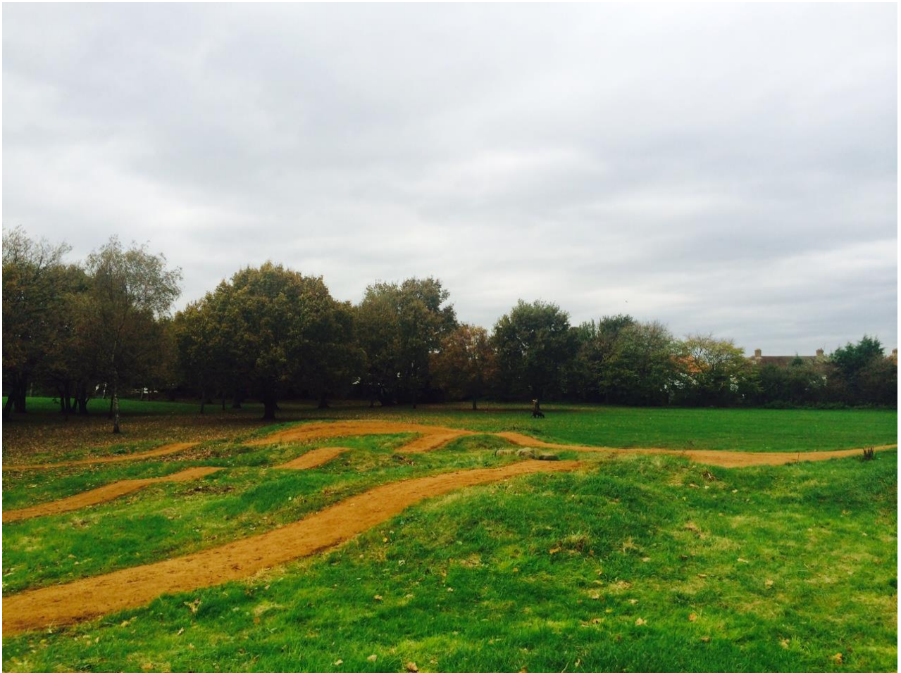
BMX Track upgrade