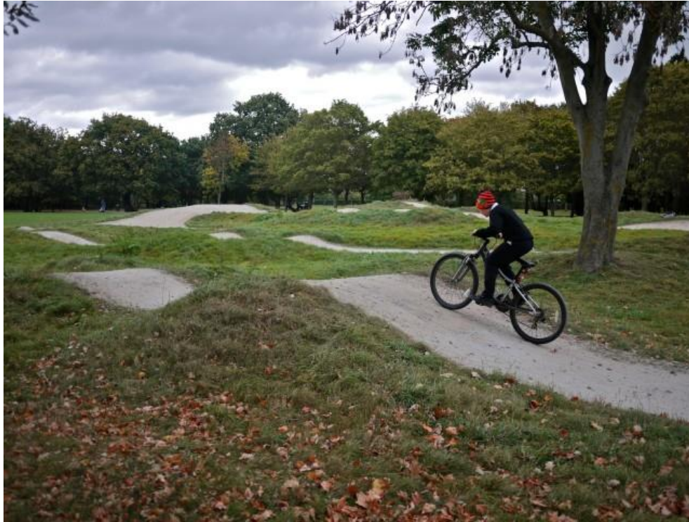
BMX track at Hampton Common

The BMX track is inspected on a daily basis by the contractor operative and monthly by RSS contractors. There are regular thorough checks of the facility and an annual inspection against ROSPA standards.