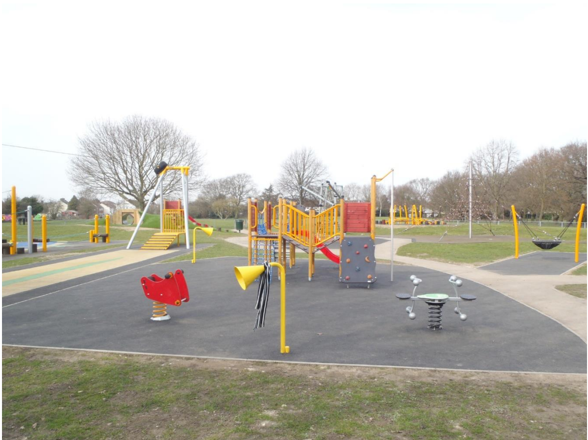
Play area upgrade 2014

Latest parks updates - London Borough of Richmond upon Thames