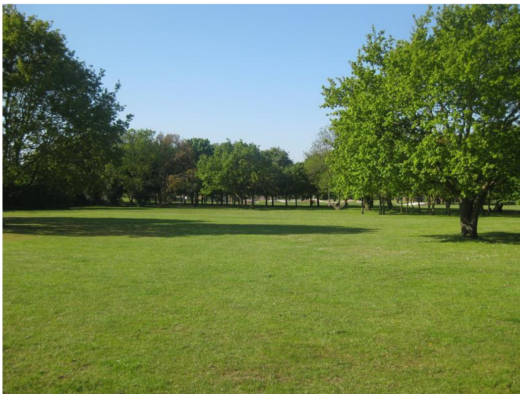
The view across Hampton Common