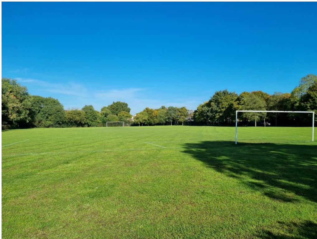
11v11 Pitch July 2023

The football pitches are all maintained by contractors. In addition to regular mowing, the contractors undertake pitch marking, sports bookings and pitch renovations during and at the end of each season.