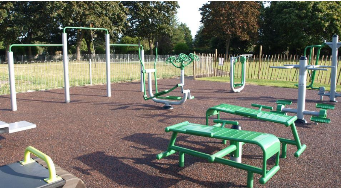
Refurbished outdoor gym