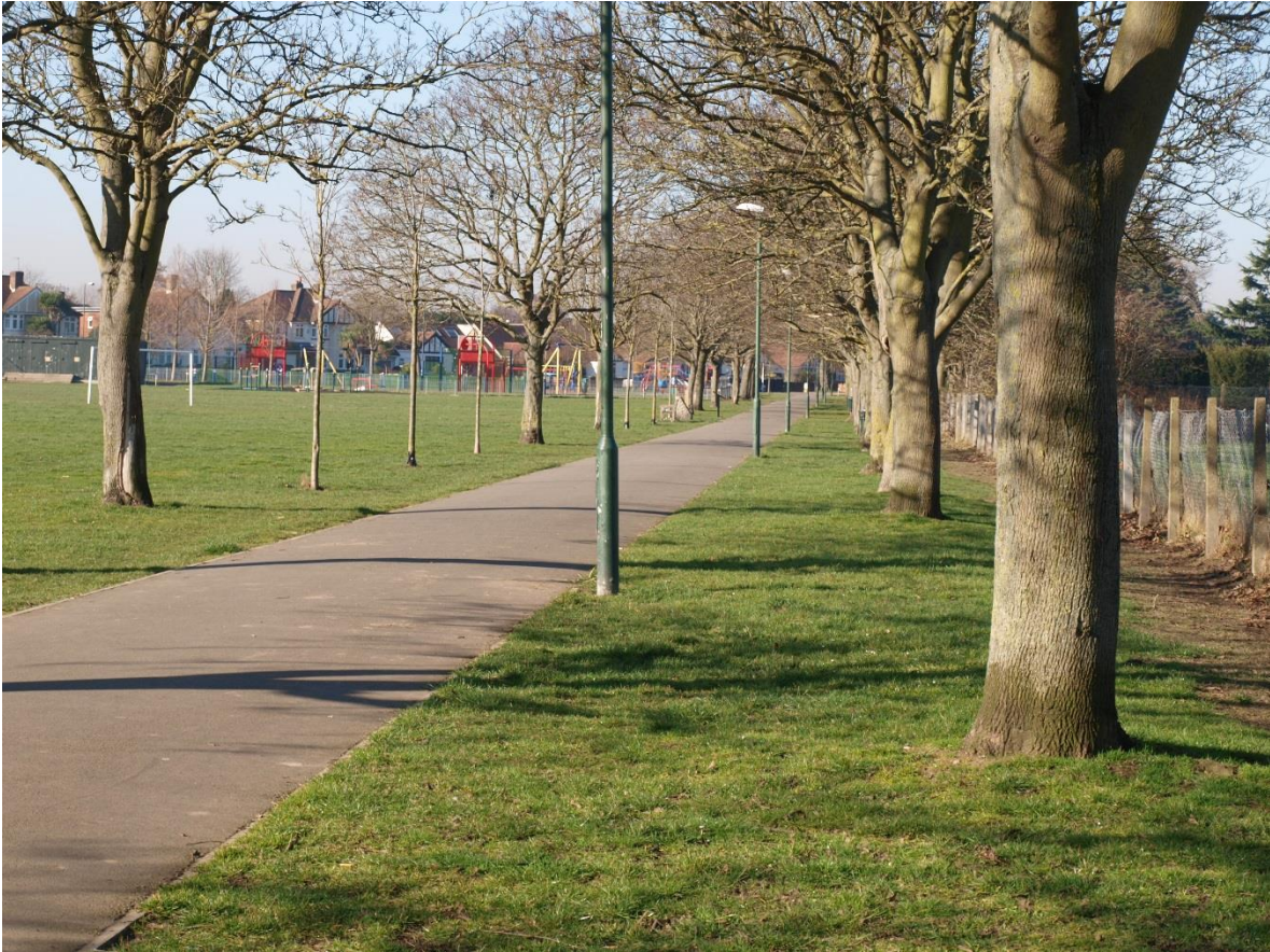
Replacement planting amongst Coronation Walk

By 1937, the park had been created and the Borough celebrations for the coronation of George VI included the planting of a commemorative avenue of oak trees at Heathfield Pleasure Grounds. Representatives of all 23 schools in the borough each planted a tree.