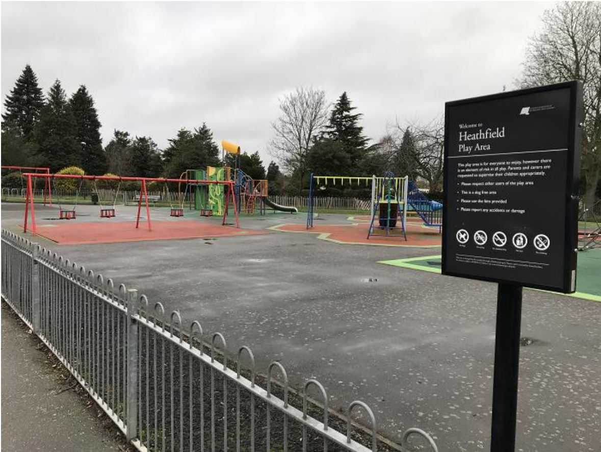
Formal play area

The formal playground is in good condition and has appropriate signage. The natural play area dates to the Playbuilder project in 2010. A rope bridge over the mounded area has now been removed and plans to replace it this year with natural climbing items are under discussion with the Friends group. In 2018 a new