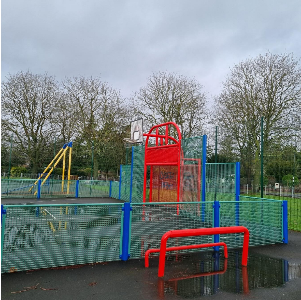
Refurbished MUGA 2022