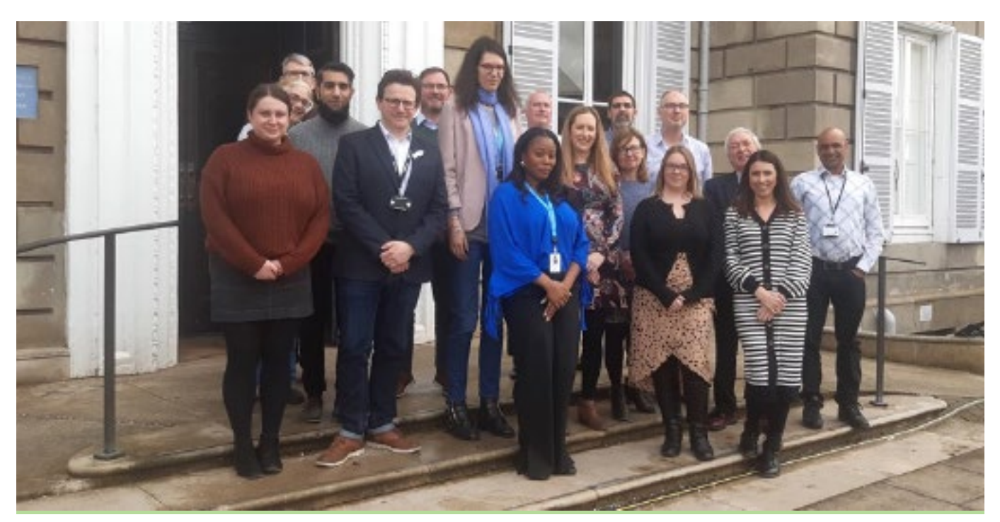
Tenants' Champion Interagency Forum held in March 2023