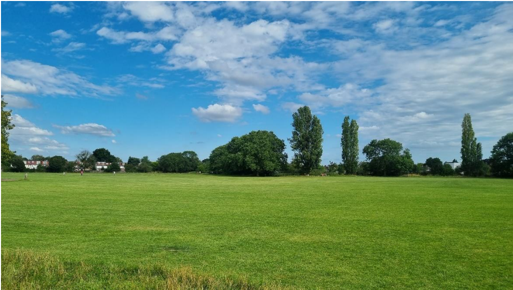
Hatherop Park main field summer 2023

The current financial situation will inevitably have a detrimental affect on the resources available to improve and maintain the borough’s parks and open spaces. The tightening of available budgets seems likely for the foreseeable future. The borough will continue to work closely with its partners, in this case Continental Landscapes and the Friends of Hatherop Park, to maintain standards. In addition, we will need to look for additional ways of funding to maintain and improve the boroughs parks, one of our most valuable assets.