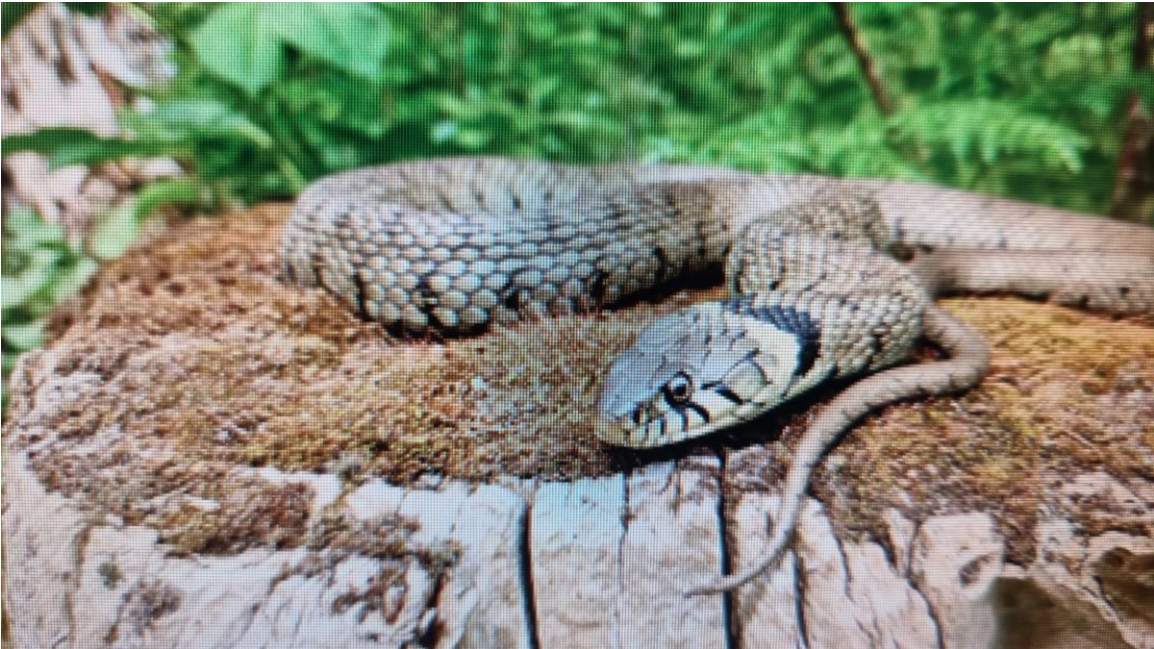
Hatherop Park Conservation area – grass snake basking