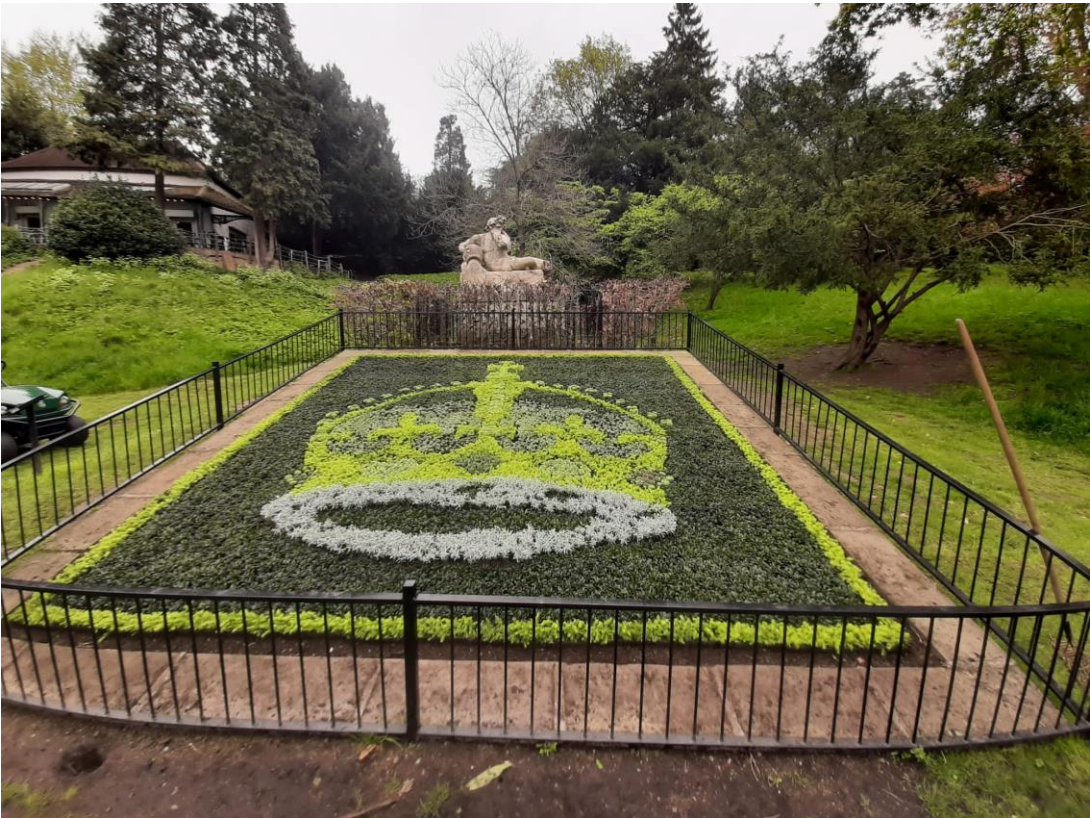
New fencing around Coronation Celebration carpet bed.