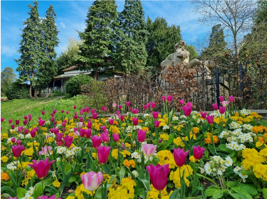
Old Father Thames and spring tulips