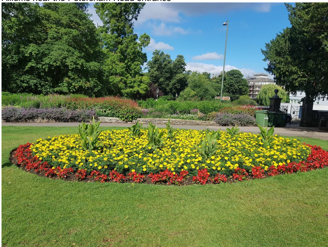
Formal bed near the Petersham Road entrance