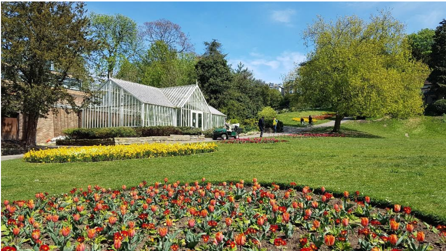
Entrance to the park from Petersham Road

The main entrance into both Terrace and Buccleuch Gardens is from the Petersham Road. The entrance areas are in very good condition with the tarmac pathway throughout both Gardens having been recently resurfaced. The wall around the attractively planted border to the right of the entrance way into Terrace Gardens has been completely renovated. Attractive corporate signage is appropriately positioned.