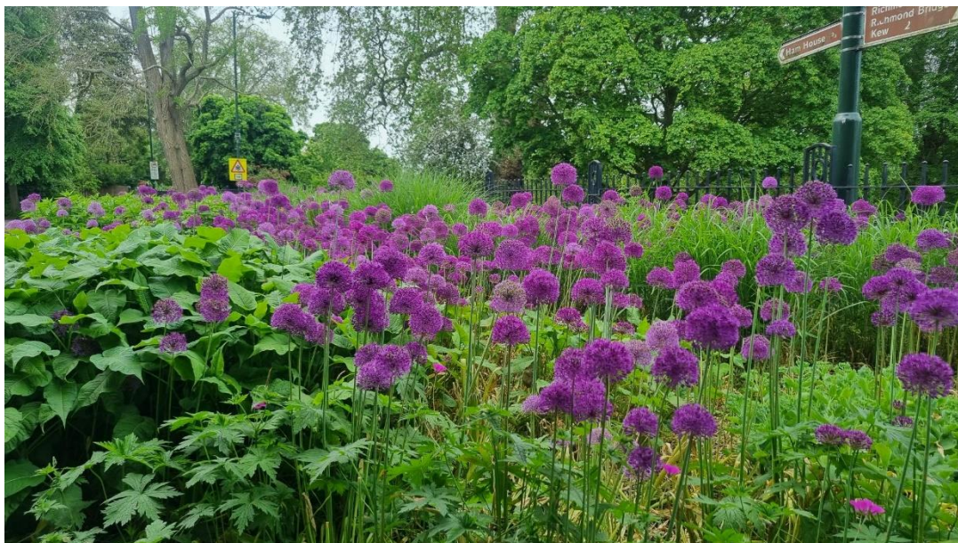
Alliums near the Petersham Road entrance

of available budgets seems likely for the foreseeable future. The borough will continue to work closely with its partners, in this case Continental Landscapes, to maintain standards. In addition, we will need to look for additional ways of funding to maintain and improve the boroughs parks, one of our most valuable assets.