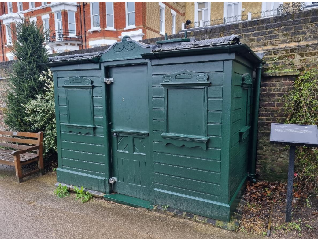
Refurbished nightwatchman's hut